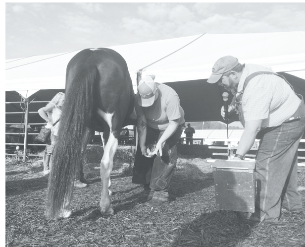
EQUINE SCIENCE STUDENTS & STAFF AT THE BOB EVANS FARM FESTIVAL