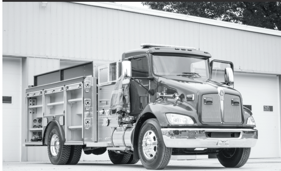
HOCKING COLLEGE'S NEWEST FIRE TRUCK