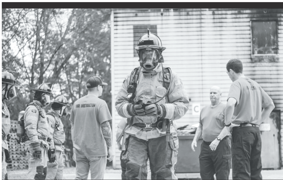
HOCKING COLLEGE FIREFIGHTER TRAINING: PERSONAL PROTECTIVE EQUIPMENT ORIENTATION