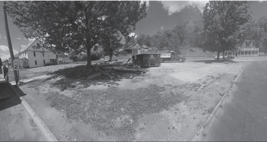
Site of the future Nelsonville Greyhound Park

The first park project to be completed in coming months will be named the Nelsonville Greyhound Park, to commemorate the former Nelsonville High School Greyhounds. Donations made by community members and former Nelsonville Greyhounds are making this community park project a reality. The park will be located at the corner of Fayette Street and Jefferson Street, and demolition began last month of a donated property for the purpose of creating a public green space.