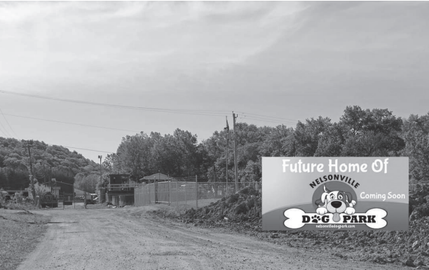
Site of the future Nelsonville Dog Park

Another major undertaking for the City of Nelsonville is an ongoing project to build a dog park in the city. The park is planned to be located on a 2+ acre lot at the site of the current Nelsonville Wastewater Treatment Plant, which is scheduled to close in 2023. The new dog park will provide a fenced area where dogs can safely run and play off-leash, and pet owners can socialize. It will include a large dog area, a small dog area and a designated training area.