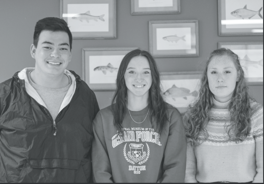
STUDENT LEADERSHIP IN THE HOCKING COLLEGE FFA CLUB

Hocking College’s FFA Club currently has 25 active members from a variety of programs and schools across the college campus. Members vote annually for their student club president, vice president and treasurer to lead their organization.