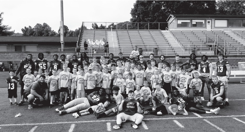
Hawks Football Team coaches and leads Youth Football Camp at Hocking College, Summer 2022

The Hocking College Hawks Men’s Football team returned to campus in July to begin pre-season training and to coach the Youth Football Camp on July 16, 2022. The youth football camp is offered each summer for free to local kids in the Nelsonville and Athens area, and provides hands-on coaching and leadership opportunities for the Hocking College football players.