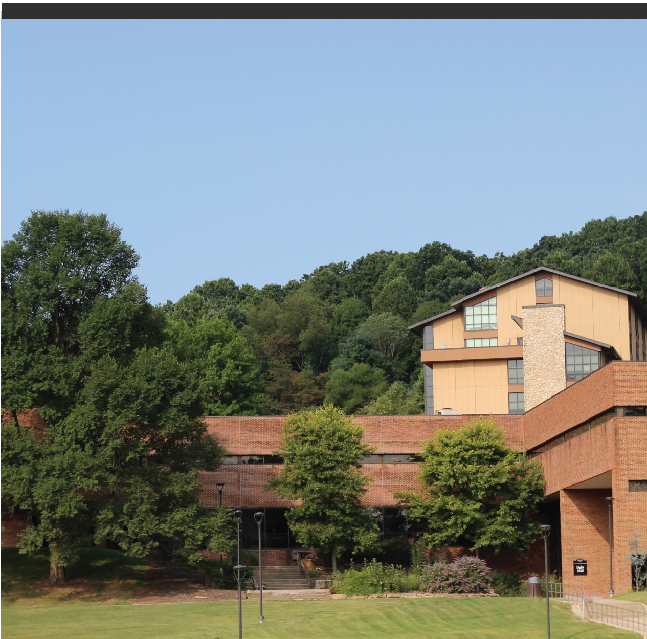
John Light Hall at Hocking College Nelsonville Campus, with Downhour Residence Hall behind

The origins of Hocking College in Nelsonville, Ohio can be traced back to Autumn of 1968 when its predecessor Tri-County Technical Institute officially opened. Dedicated to providing technical training to local residents, the TCTI was built on the campus of the Tri-County Joint Vocational School, which is now the Tri-County Career Center.