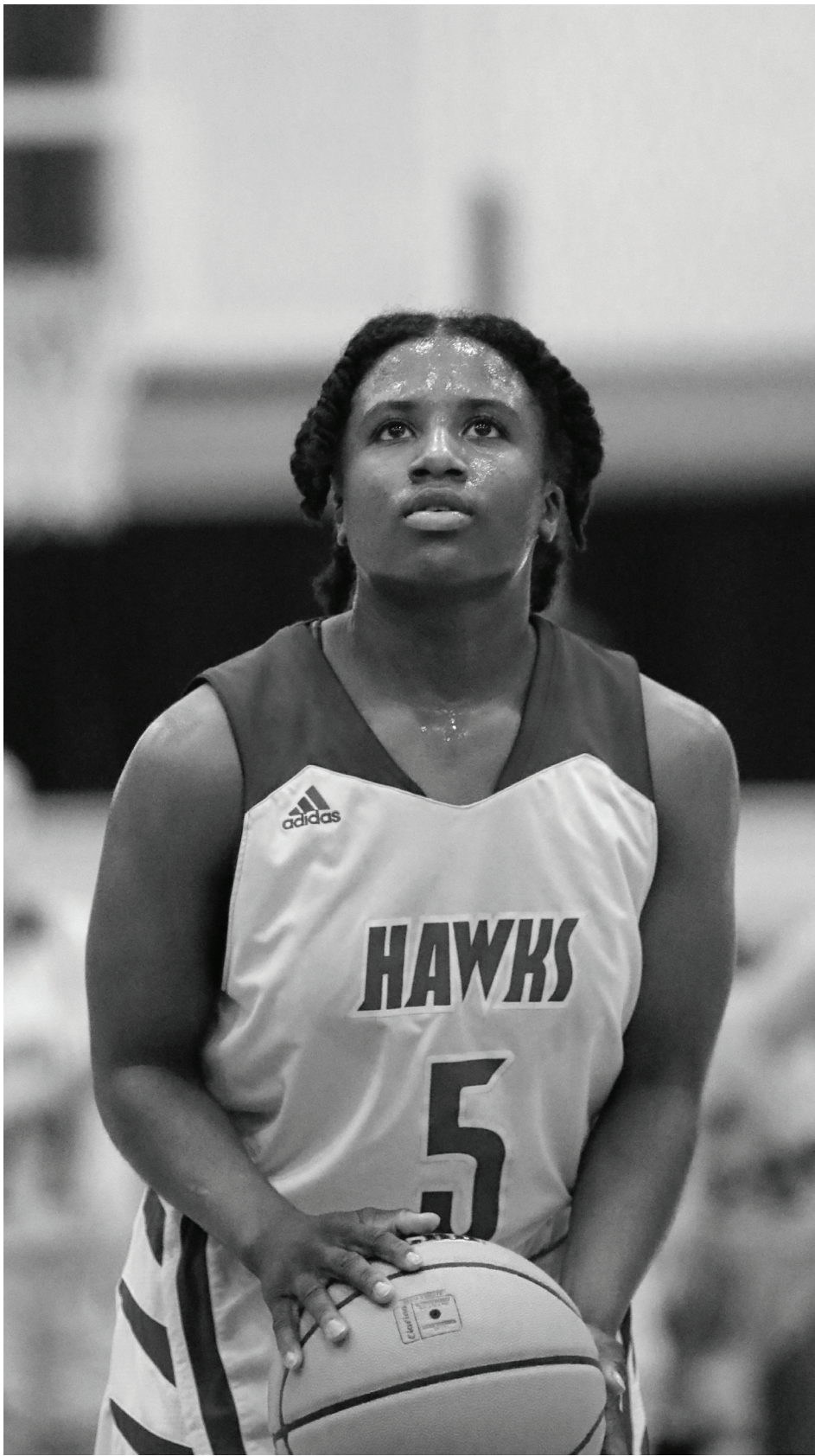
HOCKING COLLEGE’S 2020-2021 WOMENS BASKETBALL TEAM JOINED THE DIVISION II LEAGUE, AND 2 STUDENTS EARNED OCCAC POST-SEASON HONORS.