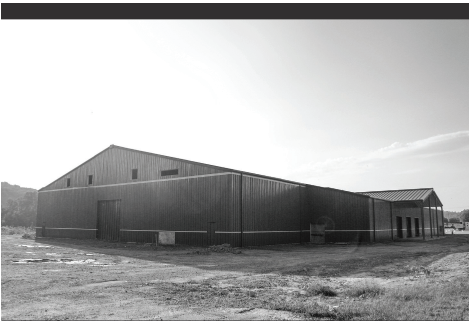
Hocking College’s newly constructed Equine Arena building, set to open alongside its outdoor arena area in 2022.

A new International Student Housing complex is currently being renovated in Nelsonville, OH. It will be available for international students to rent and commute to campus, although an expected completion date has yet to be announced.