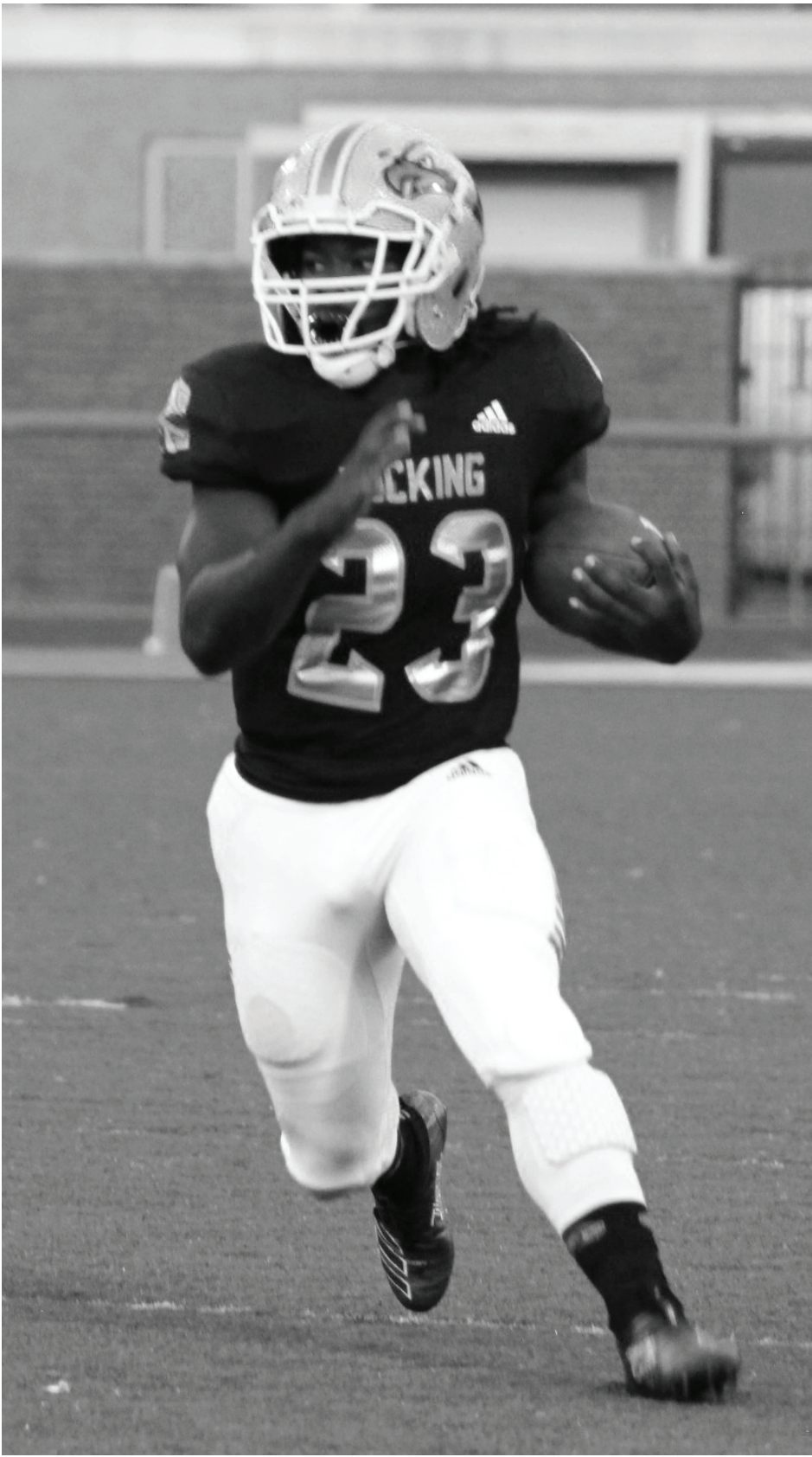
HOCKING COLLEGE FOOTBALL SEASON BEGINS! FIRST AWAY GAME WILL BE SEPTEMBER 4, 2021 AND FIRST HOME GAME WILL BE SEPTEMBER 11, 2021.