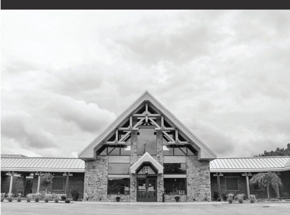
The Lodge at Hocking College, after years of renovations and upgrades, hosts its Grand Opening event in August 2021.

BLOG: www.blog.hocking.edu FACEBOOK: www.facebook.com/HockingCollege.Ohio INSTAGRAM: @hockingcollege YOUTUBE: www.youtube.com/HockingCollege-Ohio LINKEDIN: www.linkedin.com/school/hocking-college