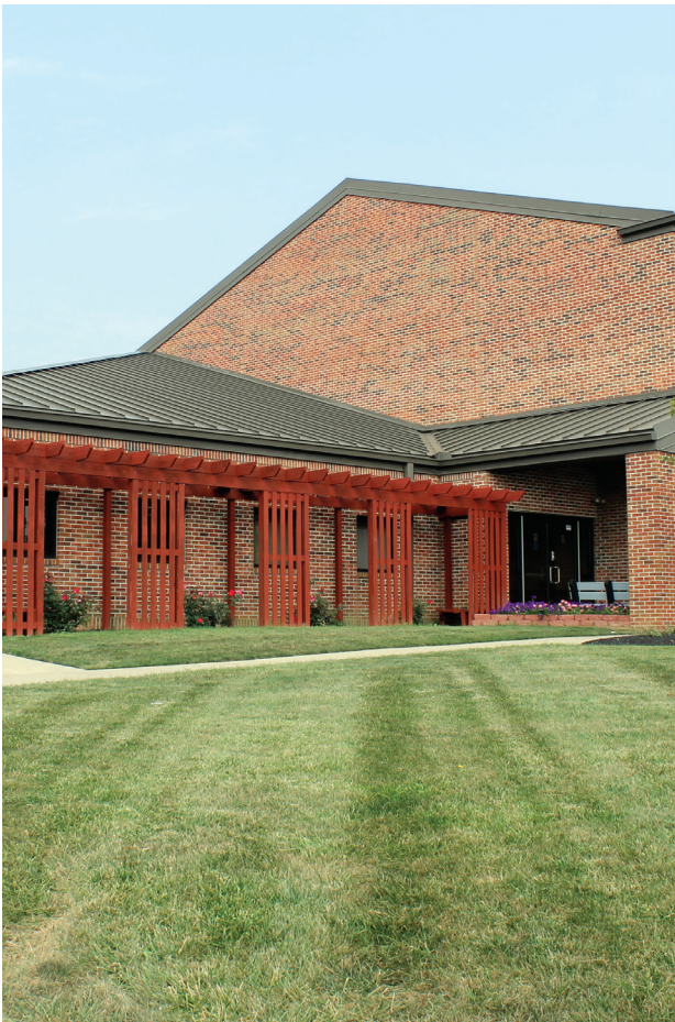
Hocking College Perry Campus main building

2021 Hocking College’s new Cabinetmaking program begins accepting new students, groundbreaking occurs on the new Athletic Fields at the Nelsonville campus, and the Lodge at Hocking College holds its Grand Opening event.