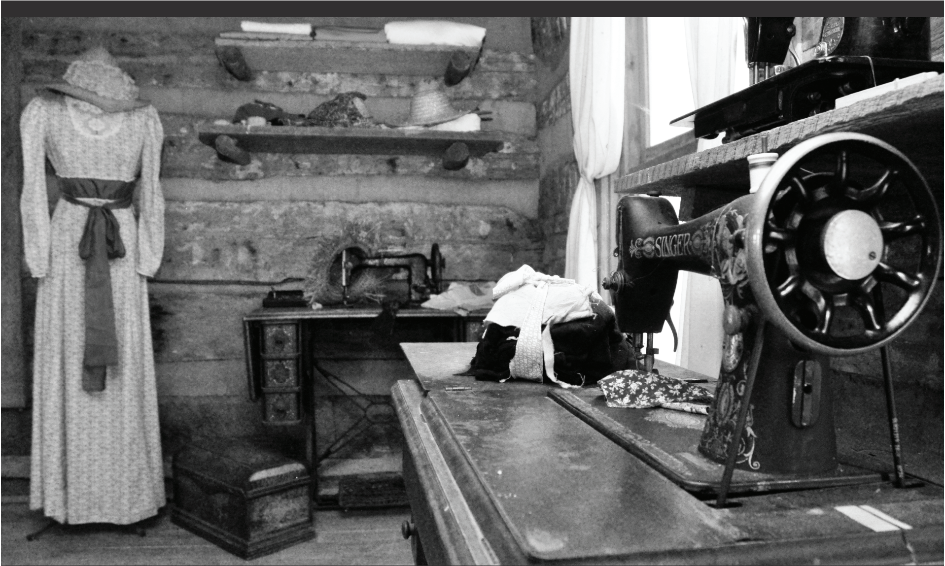
IMAGE FROM INSIDE ONE OF THE HISTORIC CABINS AT ROBBINS CROSSING, SHOWING FURNISHINGS AND CRAFTING TOOLS FROM THE 1800s ERA OF AMERICAN HISTORY

Visit us online at: www.naturecenter.hocking.edu www.robbinscrossing.hocking.edu