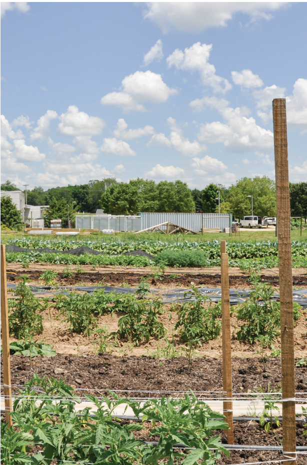
Hocking College Logan Campus farm