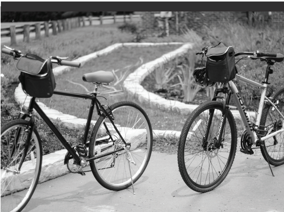
Bicycles, with helmets and binocular pouches, now available for rental at the Hocking College Nature Center.