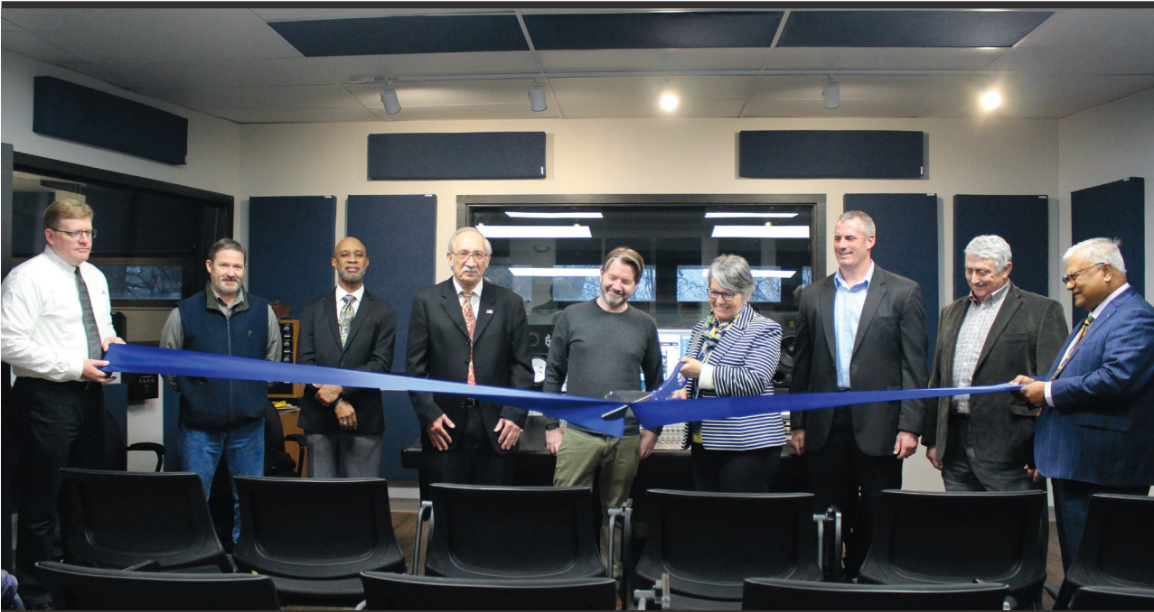
OPENING RIBBON IS CUT ON THE SHAW HALL RENOVATIONS FOR THE MUSIC & RECORDING INDUSTRY PROGRAM’S NEW CLASSROOM STUDIO