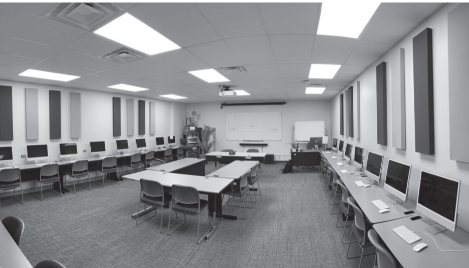
NEW FILM & VIDEO PRODUCTION IMAC EDITING LAB