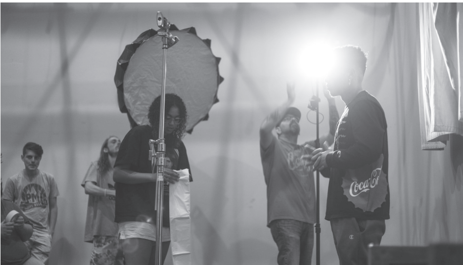
RENOVATED FILMING STUDIO IN USE BY STUDENTS

Last year’s renovations in the school included a new sewing lab and retail lab space for the Fashion Design & Retail Merchandising Program, which includes screenprinting, weaving, sewing, mending and other textile-based tools. Thanks to these new resources, the program was able to launch its own entrepreneurial venture of HC Alterations, a mending service available at low cost to the local community and to Hocking College faculty and staff, and at no cost to Hocking College students.