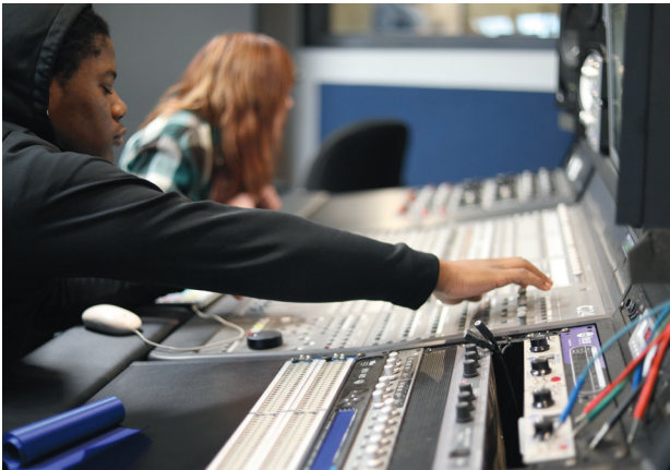
STUDENTS WORKING ON NEW MIXING BOARD