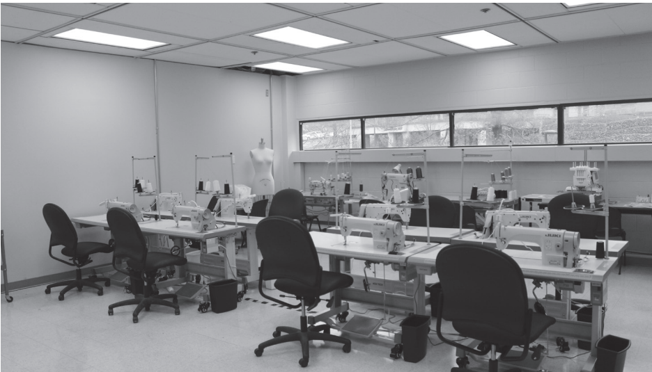
SEWING LAB WITH COMMERCIAL-STANDARD MACHINES