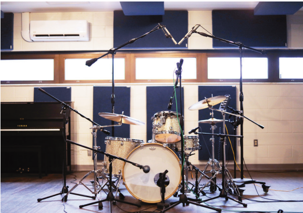
RECORDING ROOM SET UP WITH DRUM SET AND MICROPHONES