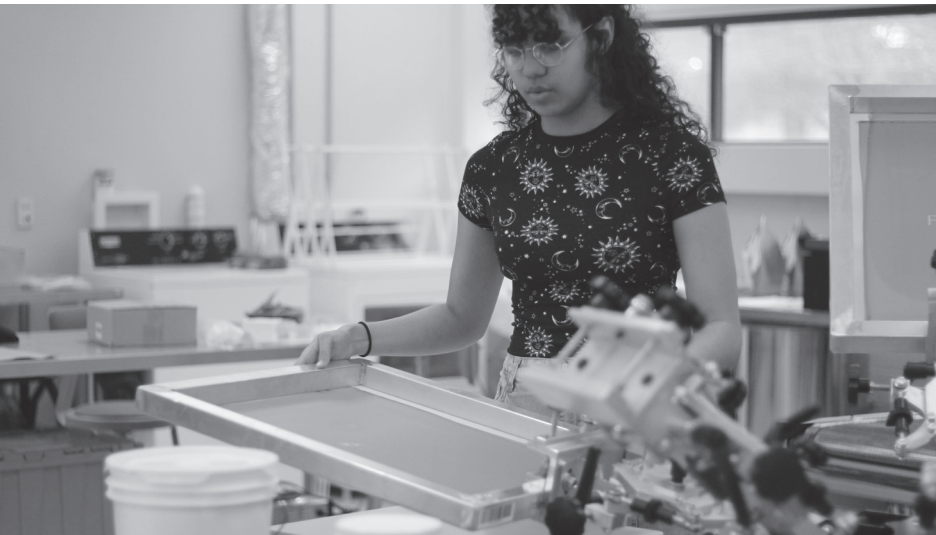
SCREENPRINTING TOOLS IN THE FASHION DESIGN LAB

Last year’s renovations in the school included a new sewing lab and retail lab space for the Fashion Design & Retail Merchandising Program, which includes screenprinting, weaving, sewing, mending and other textile-based tools. Thanks to these new resources, the program was able to launch its own entrepreneurial venture of HC Alterations, a mending service available at low cost to the local community and to Hocking College faculty and staff, and at no cost to Hocking College students.