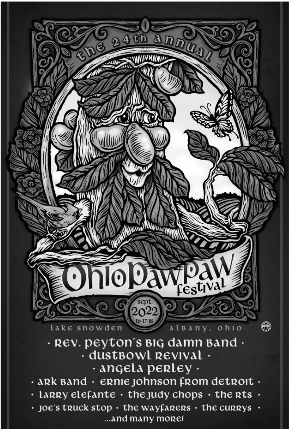
Above: 2022 Pawpaw festival poster, from ohiopawpawfest.com home page

The Annual Pawpaw Festival will be held at Lake Snowden on the weekend of September 16-18, 2022. At the festival, you can expect to find pawpaw beverages, foods and goods, as well local food trucks and craft vendors with non-pawpaw related items. This year will celebrate the 24th anniversary of the festival which celebrates the native Ohio fruit. In addition to local vendors, the festival holds informational activities and presentations that cover pawpaw growing, cooking and other uses. Local bands will perform at the 24th Pawpaw festival such as Rev. Peyton’s Big Damn Band, Dustbowl Revival, Angela Perley and more. Contests such as Best Pawpaw , Pawpaw Cook-off and Pawpaw Eating Contest will be held throughout the weekend, and themed tents are set up for native pollinator information, holistic wellness, and a kid’s tent with fun activities for the whole family. Visit ohiopawpawfest.com for more information and to purchase tickets! The Pawpaw festival is held at Lake Snowden, a park and campground owned and operated by Hocking College, and serves as a live learning lab for Hocking College Natural Resources program students. When you visit the Pawpaw festival this year, say hello to staff and students at the Hocking College booth at the annual festival, which will have educational information about plants, animals and the natural history of southeast Ohio.