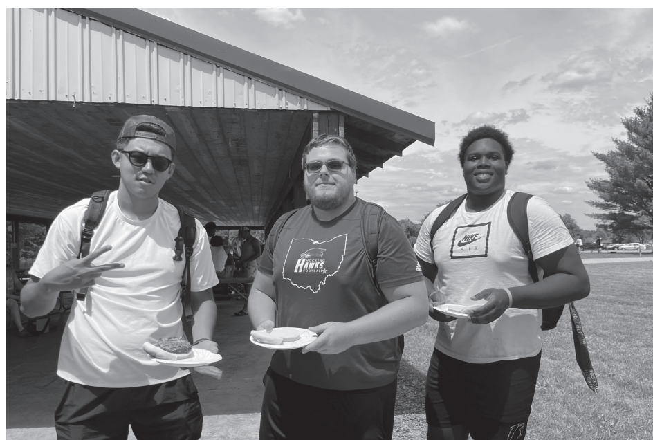
Above & Right: Students & Staff participate in Start Week events on Campus and at Lake Snowden, including cookouts, bonfires and karaoke nights