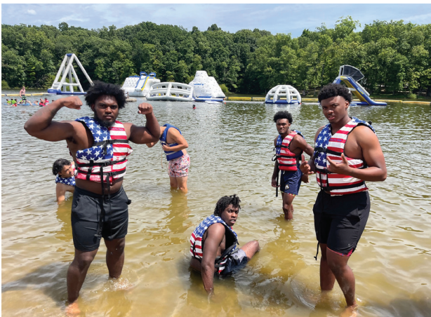
Students participating at Start Week events at Lake Snowden Park

Hocking College welcomed back more new and returning students than the college has seen since COVID-19 during this year’s Autumn Start Week