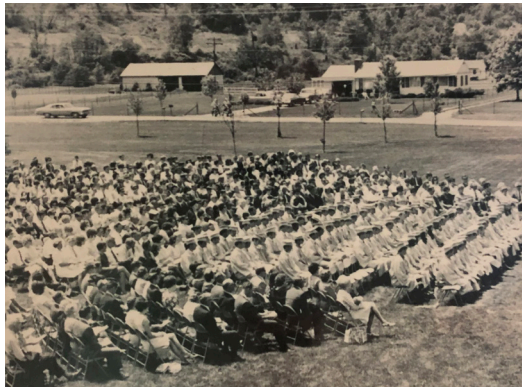
This photo from the Hocking College archives shows the first Hocking College graduating class in 1970.

Throughout the 1980s, HTC continued to grow. As buildings and programs expanded, HTC became renowned for its Natural Resources, Nursing, Public Safety, and Culinary and Hospitality programs. During the 1990s, Hocking Technical College became known as Hocking College. A satellite campus was opened in Perry County, and the college acquired Lake Snowden, a live learning lab for Natural Resources Programs.